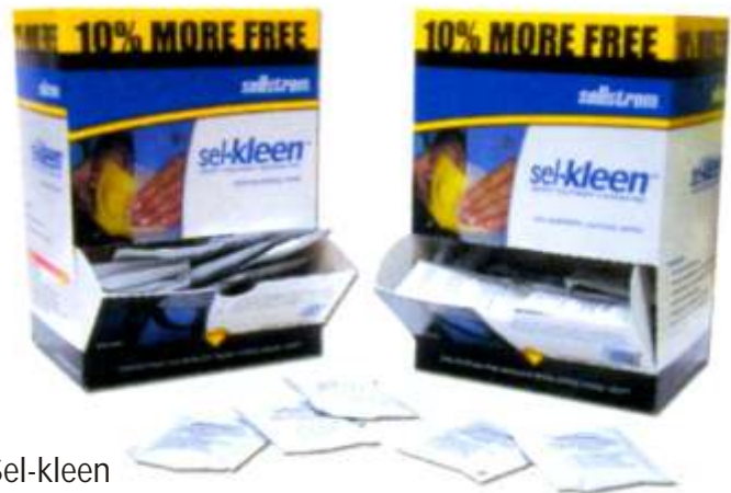
Sel-kleen Pre-Moistened Equipment Cleaning Packets