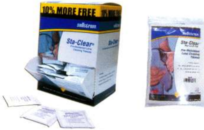
Sta-Clear Pre-Moistened Lens Cleaning Tissue Packets