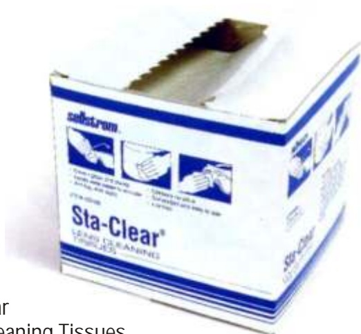
Sta-Clear Lens Cleaning Tissues