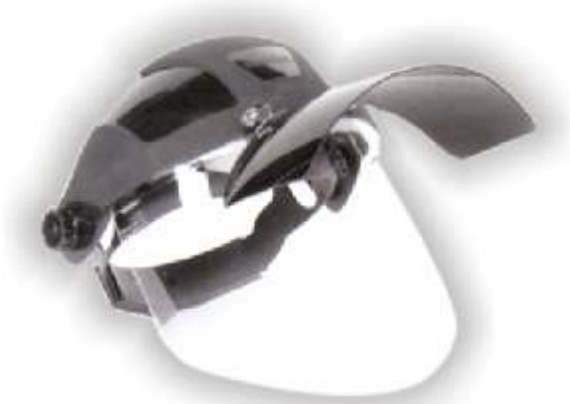
Fl a me AND PLASMA CUTTING